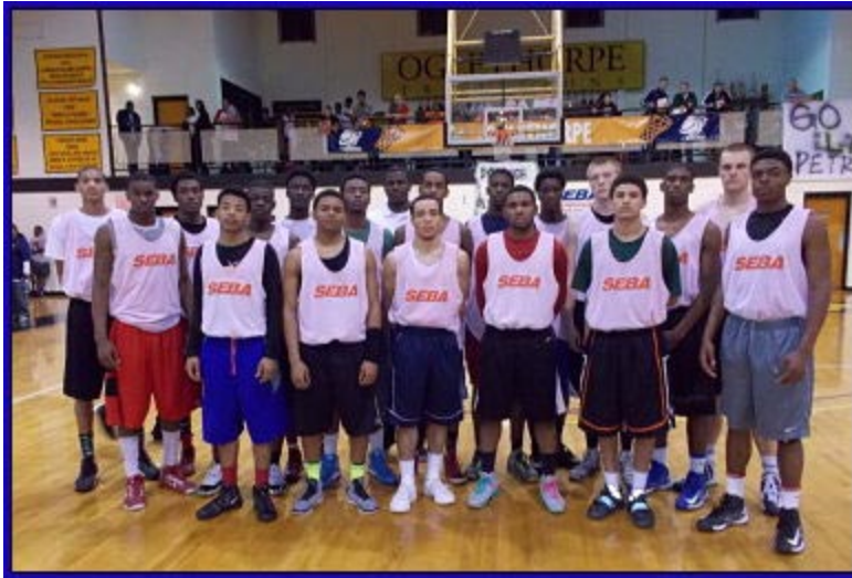
Team Photo of "East" Squad (Top 30 All-Star Game)

Athletic and versatile guard with good size. Is capable of running the point or playing the shooting guard spot. Got to the basket and finished consistently throughout the day. Very good rebounder from the guard position. Was named Player of Year in Region 2-AA and Honorable Mention All-State.