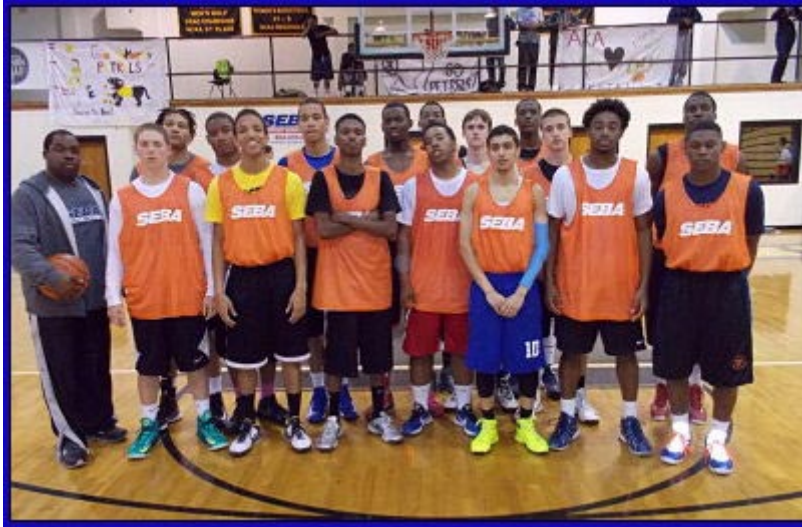
Team Photo of "West" Squad (Top 30 All-Star Game)